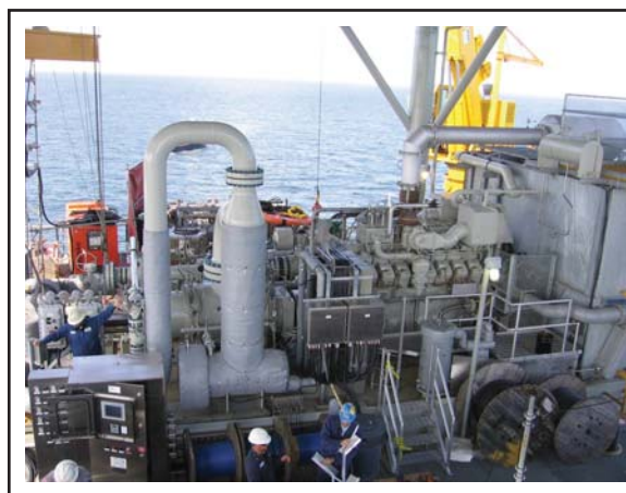
A multiphase pump packaged with a natural gas-fired engine lowered system back pressure and increased production by 40 percent from 18 gas-lifted wells at Chevron’s Main Pass 59A platform in the Gulf of Mexico.

Subsea pumps typically are delivered as part of a full system on a standardized