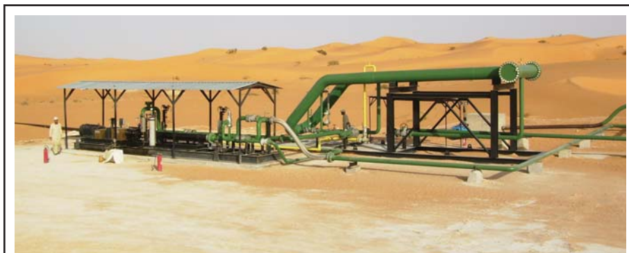
In Algeria, multiphase pumps are being used to produce gas-locked oil wells and optimize flowline pressure to get oil to a central battery, with all pump data monitored from a central control office.

oil wells are now producing, and flaring has been eliminated, increasing sales gas and reducing emissions,” he comments.