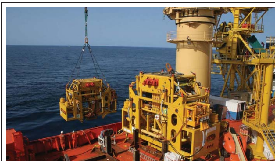
Three subsea multiphase pumps installed in almost 5,600 feet of water at BP's King Field have a tieback distance of 20 miles and total capacity of nearly 75,000 barrels a day at a gas volume fraction of 98 percent.

Subsea metering is gaining momentum, with 30 percent of all new subsea wells developed last year equipped with multiphase meters, according to Olsvik. A big incentive for included metering subsea is increased overall recovery. A 2004 study by the Norwegian Petroleum Directorate found 20 percent higher hydrocarbon recovery rates from topside versus subsea, says Olsvik. "The lack of data about individual subsea wells makes reservoir management more difficult and results in lower recovery," he says. "With more measurement in place, operators can more effectively manage the reservoir and improve recovery rates." □