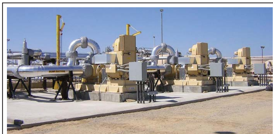
Aera Energy has three multiphase pumps handling 1,000 wells producing heavy oil using a combination of steam flooding and multiphase pumping at its Belridge Producing Complex in California.

In Algeria, Amburgey reports that multiphase pumps were used to increase flowline pressure to get oil to a central battery, with all pump data monitored from a central control office. “Gas-locked